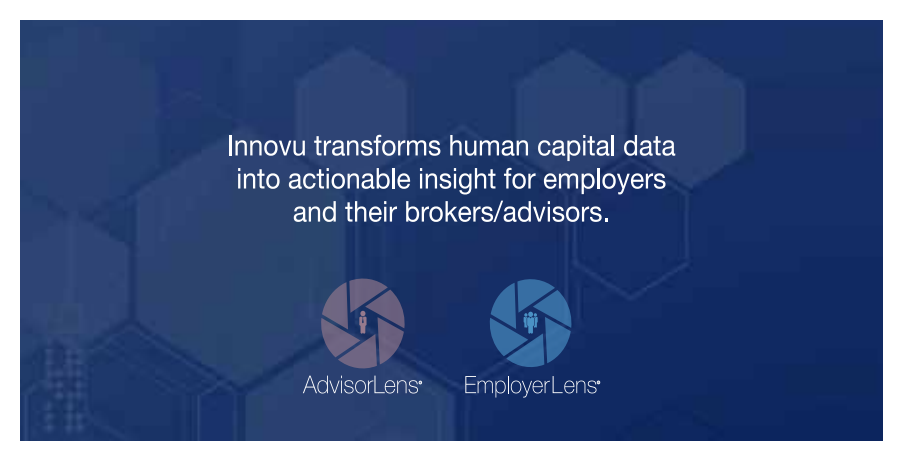
Integrate | Trust | Analyze | Engage & Collaborate | Transform