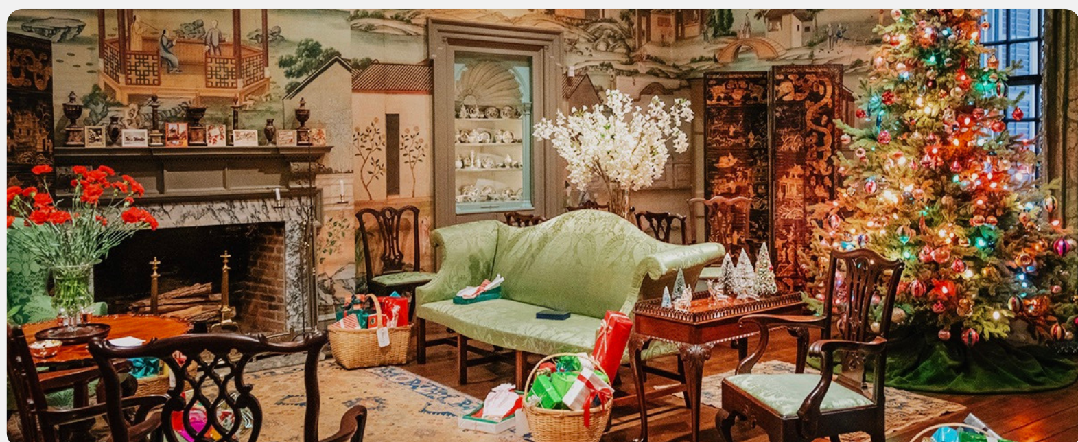
Yuletide Tour, Winterthur, DE

Serving Southeastern Pennsylvania, Southern New Jersey, and Delaware