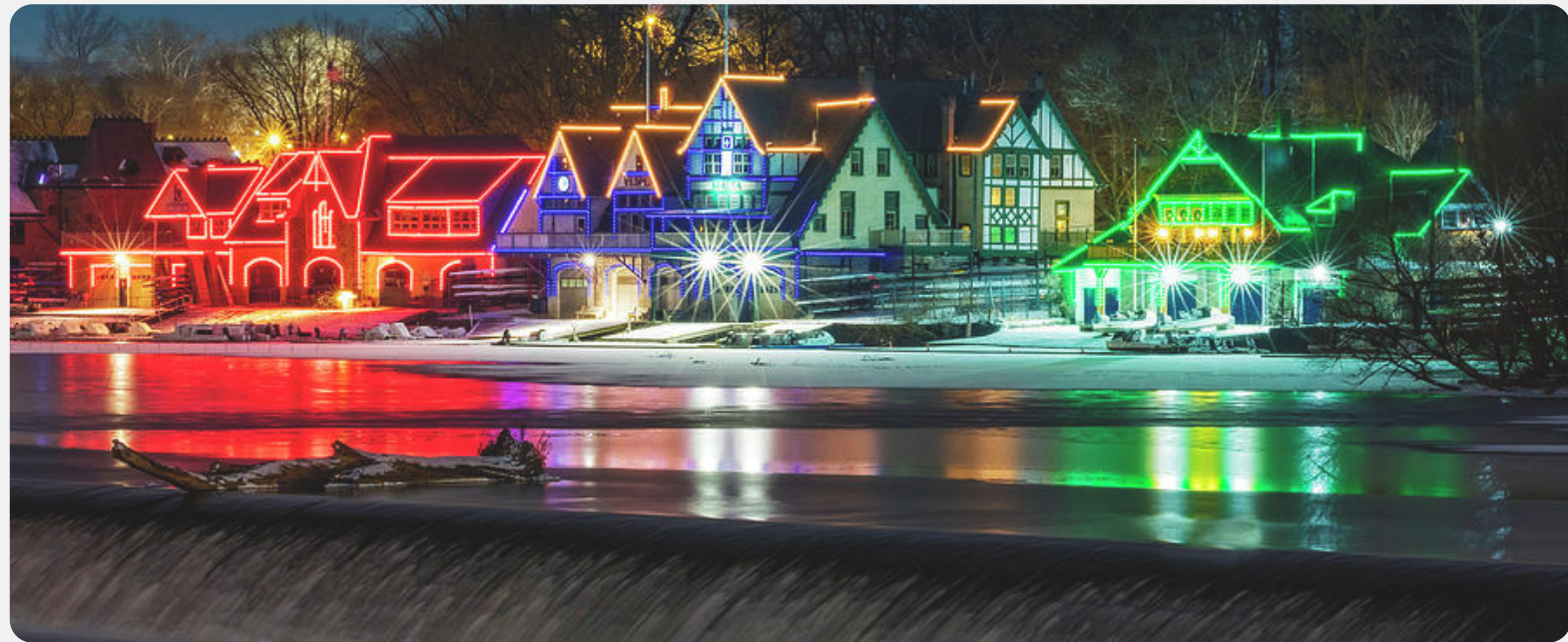
Boathouse Row, Philadelphia, PA

seeks to increase the value of health benefit spending for the region's employers. We do this by improving workforce and community health, increasing healthcare quality and safety, and reducing healthcare costs. The Coalition represents employer interests in working with health plans, healthcare providers, benefits consultants, suppliers and other system stakeholders to address population health priorities and to ensure that when healthcare is needed it is accessible, affordable, equitable, high-quality, and safe.